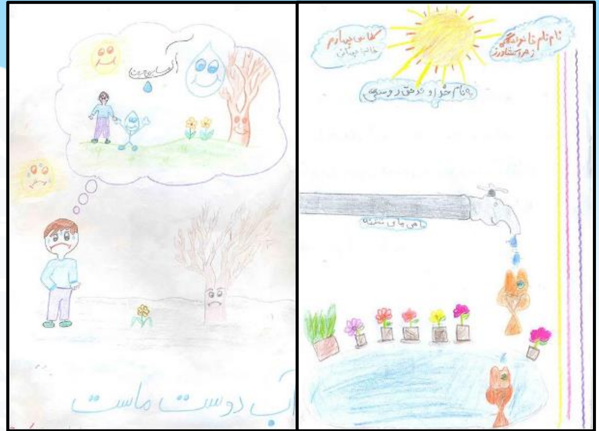
Iranian children's drawings on the significance of saving and conservation of water.